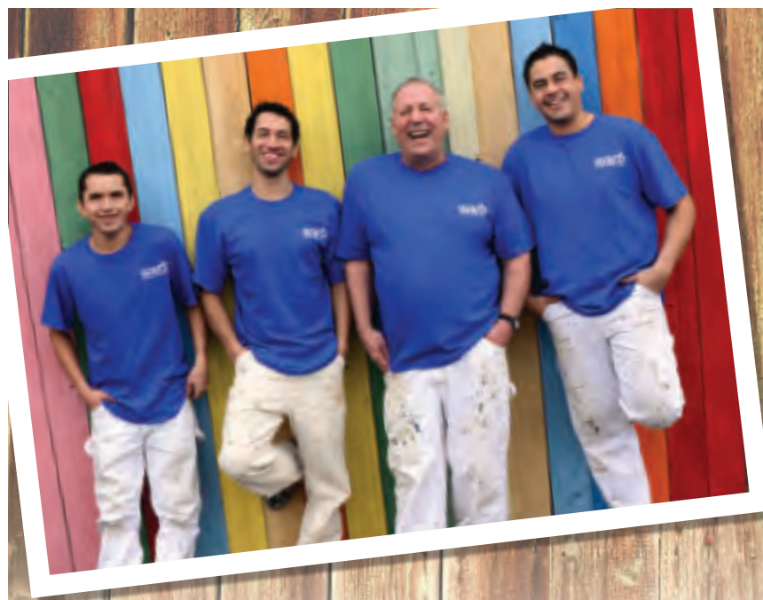
Olympic Painters | 612.770.3535

65 Main St SE, Minneapolis · 612.331.4544 wilderoastcafe.com · facebook.com/wilderoastcafe