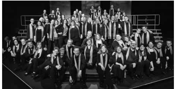
One Voice Mixed Chorus, 2012