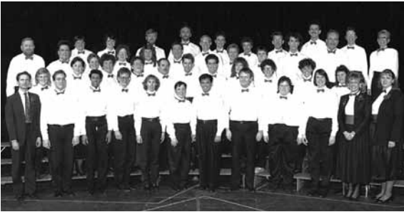
Premiere Concert, 1988